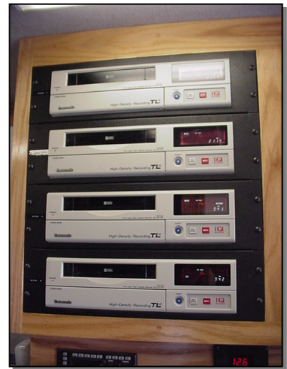
Digital Recorders also available