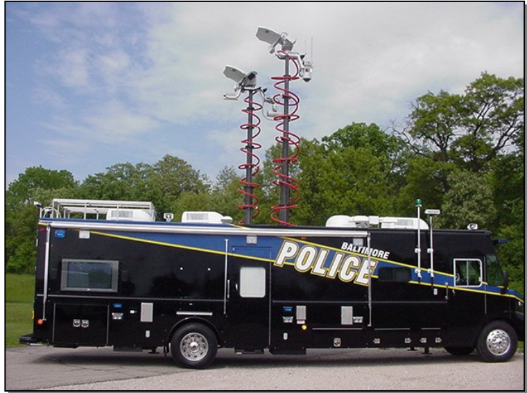
Shown with NS Mechanical Mast Option

Ask to see some of our actual customer vehicles and immediately see the difference. See the basic specifications of each below. Call for detailed specifications if required.